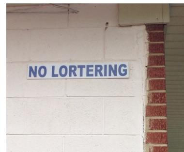
A good "error spotter."